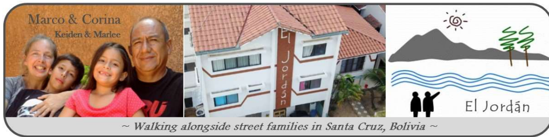
~ Walking alongside street families in Santa Cruz, Bolivia ~