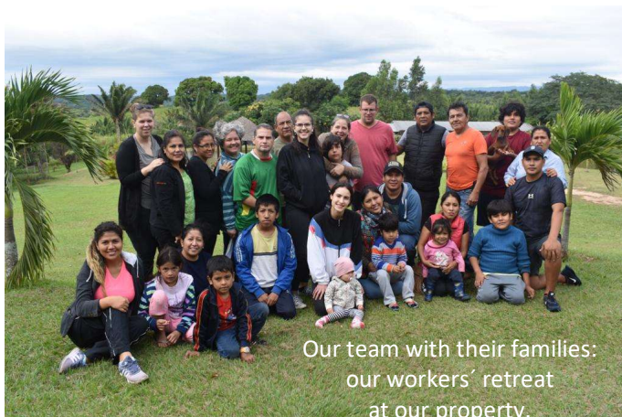
Our team with their families: our workers' retreat at our property.

God is at work. We are grateful to be a part of what He is doing. But at times we feel battered in the battle.